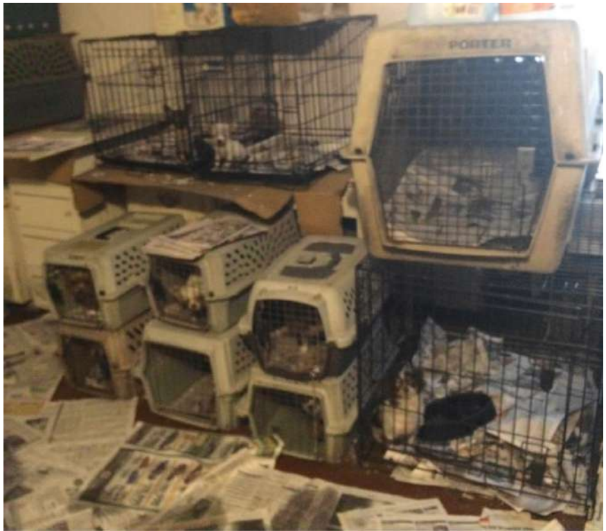
Linda Lynch was found operating an unlicensed breeding facility in Texas. Inspectors found dogs in tiny cages, piled up and surrounded by clutter. It appeared the dogs barely had enough room to turn around. The facility is now state licensed.

of a 2016 HSUS undercover investigation. However, revocations are rare. The USDA enforces only the minimum