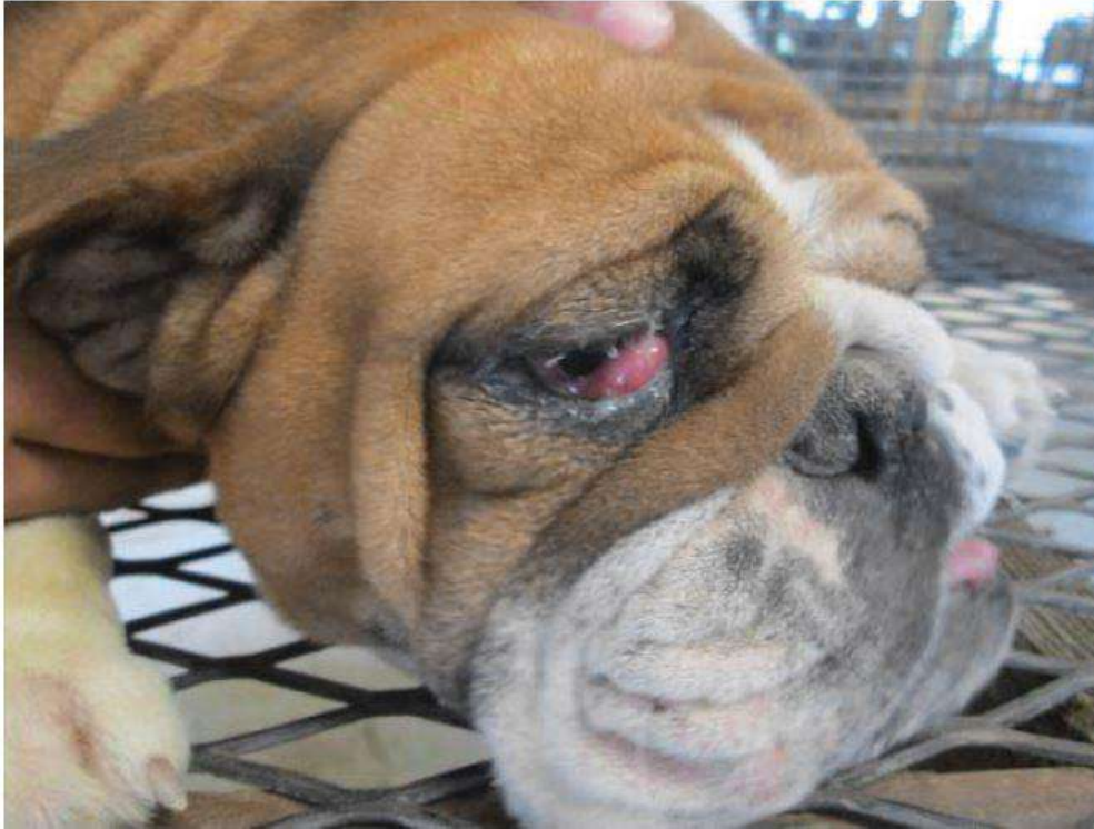
Steve Kruse’s Stonehenge Kennel in West Point, Iowa was found with at least 41 dogs in need of veterinary care since 2015, including this bulldog with an eye disorder.

promptly noticed and treated.” During the same visit, inspectors also noted a number of unsanitary conditions at Beukelman’s kennel that could lead to illness or discomfort in the dogs, including three mice found floating in two different dirty water buckets that had been provided to the dogs as drinking receptacles, “husbandry” tables covered with dust, cobwebs, syringes, dog medications and/or dead flies, and excessive feces and grime in some of the dogs’ enclosures. USDA #42-A-1054.