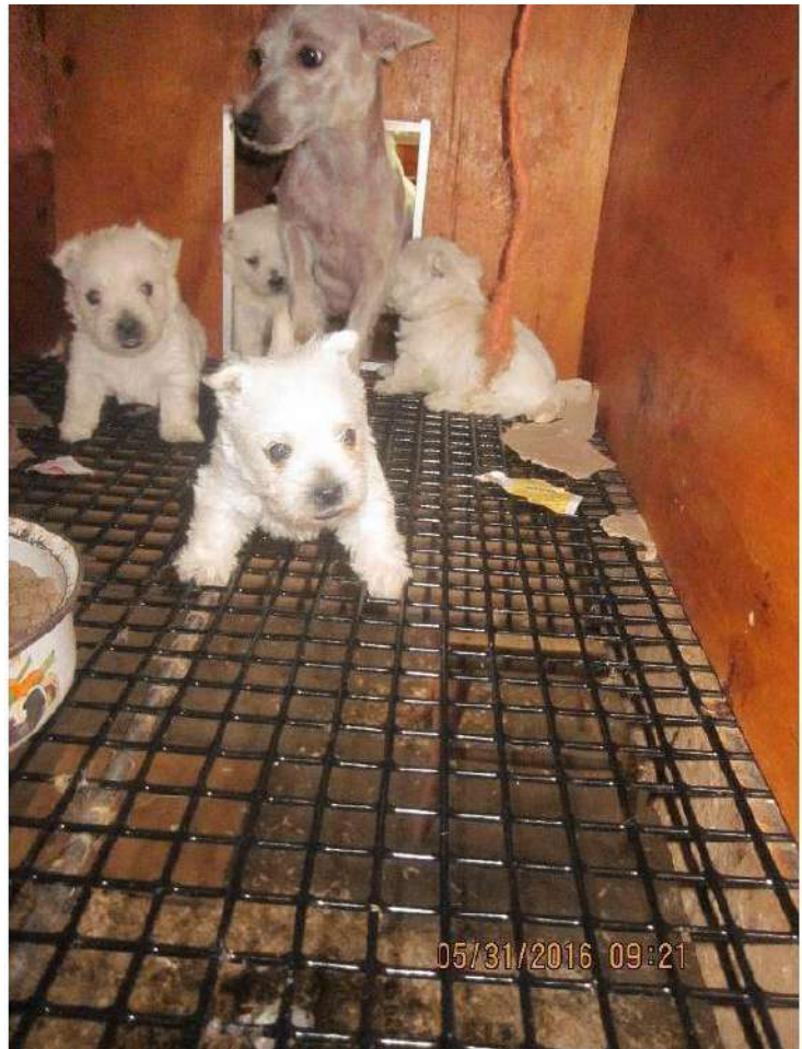
Puppies at the facility of Alvin Nolt in Thorpe, Wisconsin, were found on unsafe wire flooring, a repeat violation at the facility. Wire flooring is especially dangerous for puppies because their legs can become entrapped in the gaps, leaving them unable to reach food, water or shelter.

The information in this report, therefore, is a compilation of records obtained from state inspection data in those states that inspect puppy mills, and/or from recent USDA records that The HSUS preserved before the USDA removed the reports from