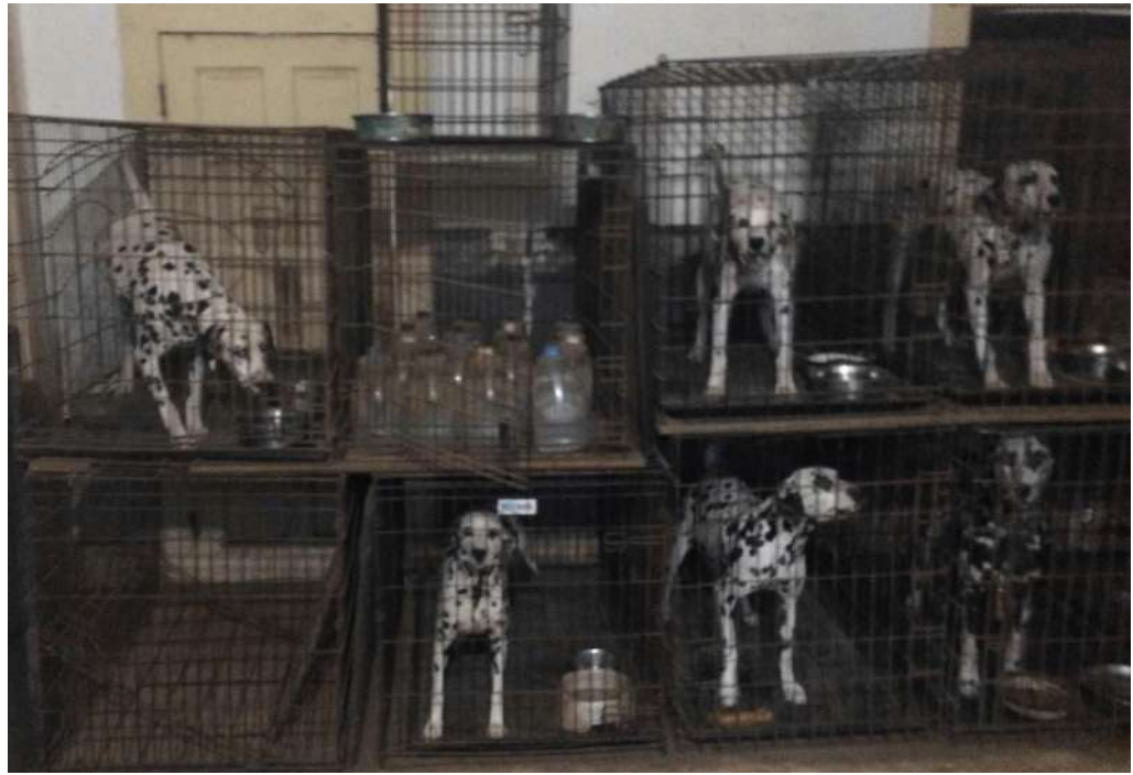
Jack and Dorothy Foreman were fined by the state after operating an unlicensed breeding facility. Dalmatians were found housed in stacked wire crates in dirty, cluttered rooms. The facility is now state licensed.

require puppies to be at least eight weeks of age prior to sale for their health and safety. Franco also failed to include the required records with the puppy, including detailed health records, according to the state's complaint, and failed to respond to the buyers when they requested compensation for veterinary bills. The underage puppy appeared to be suffering from a congenital defect. According to the complaint; she was "diagnosed with megaesophagus- congenital, aspiration pneumonia, and coccidian." The puppy was euthanized in April 2016.